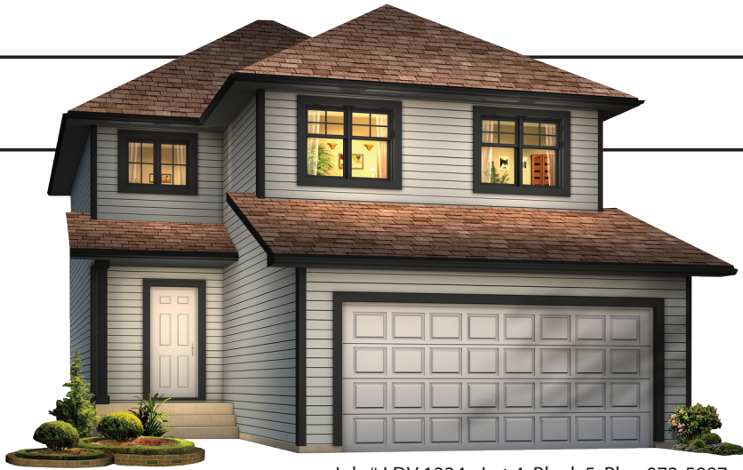
Job # LDV 1224 - Lot 4, Block 5, Plan 072-5987